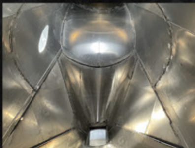
Clean Bore Interior