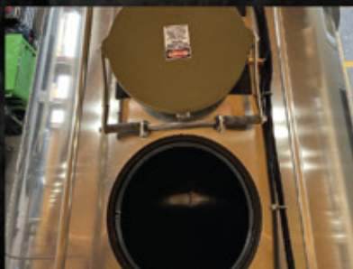
Remote Operated Manways