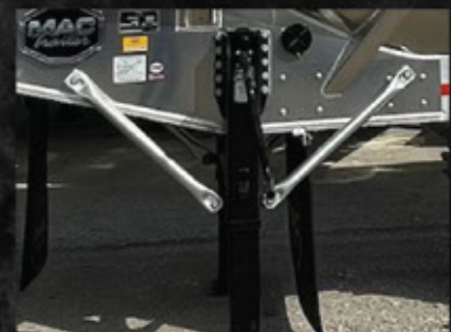
HD Bracing for Drop and Hook