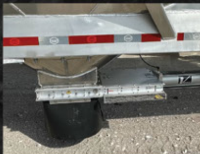
16in Knife Gate Valve