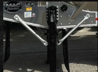
HD Bracing for Drop and Hook