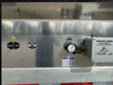
Operator Control Panel