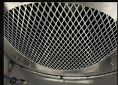
Void Access Security