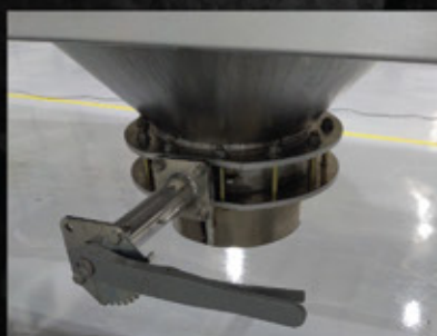
12in Butterfly Valve