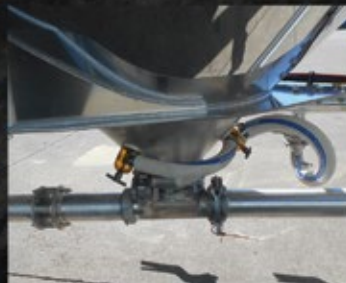
Food Grade Aerators and Hoses