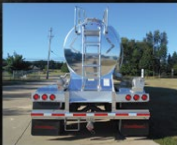
102" Wide Low Center of Gravity