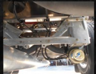
Galvanized Suspension Hangers and Soft Coat Axles