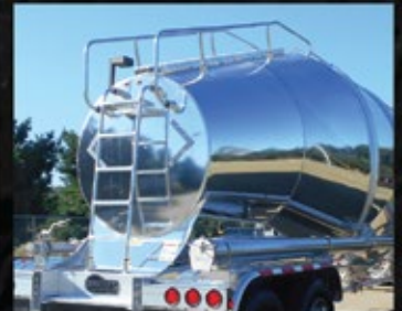
Transition Walkway with Handrails