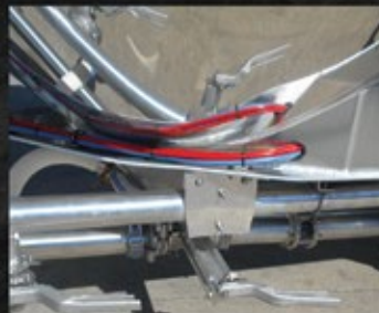
Wiring and Airline Accessibility