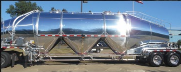
Light Weight Frameless Design